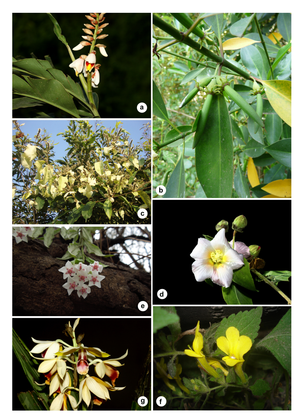
Plate 2: a. Alpinia malaccensis (Burm.f.) Roscoe; b. Brugiera cylindrica (L.) Bl.; c. Combretum album Pers.; d. Hibiscus fragrans Roxb.; e. Hoya acuminata (Wight) Benth. ex Hook. f.; f. Lindenbergia hookeri C.B. Clarke; g. Phaius tankervilleae (Banks) Blume